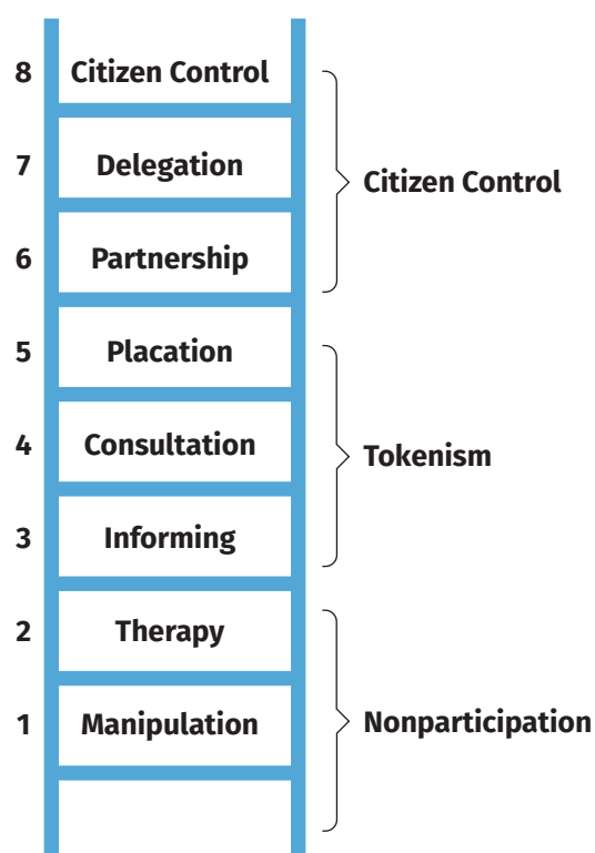
Figure 2 Arnstein's Ladder (1969) Degrees of Citizen Participation